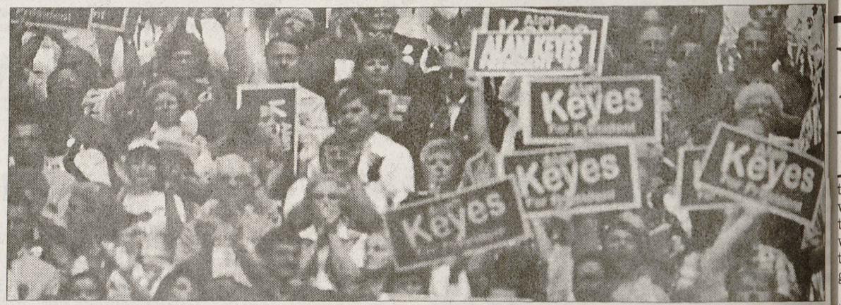
Delegates rallied when Alan Keyes took the stage at the 1996 Texas Republican convention in San Antonio.

Alan Keyes, Steve Forbes, Pat Buchanan and Ralph Reed addressed GOP delegates