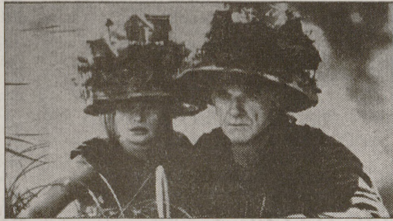
Leslie Nielsen and Nicollette Sheridan star the latest parody, Spy Hard .

the world. Steele teams up with Russian Veronica Ukrinsky, Agent 3.14 (Nicollette Sheridan), to help find her father, a scientist,