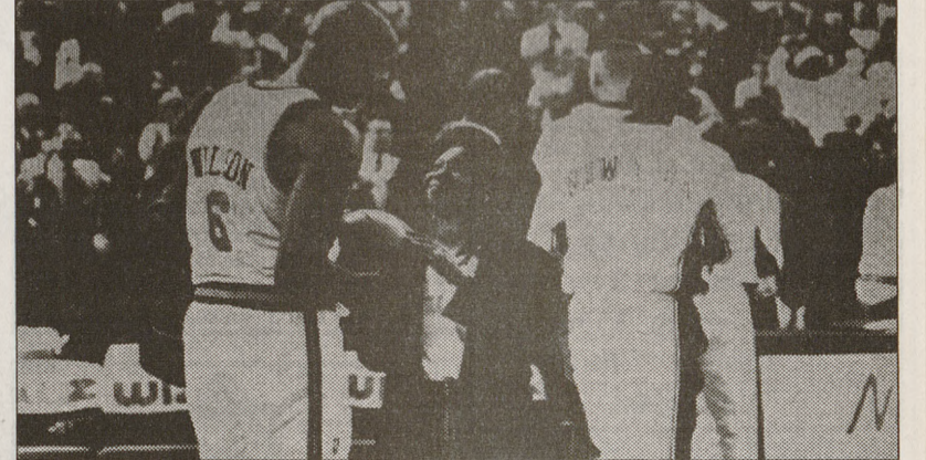
Whoopi Goldberg stars as "Eddie," a die-hard New York Knicks fan, who wins the opportunity to coach the team.

Eddie simply does not meet the expectations of a Whoopi Goldberg comedy.