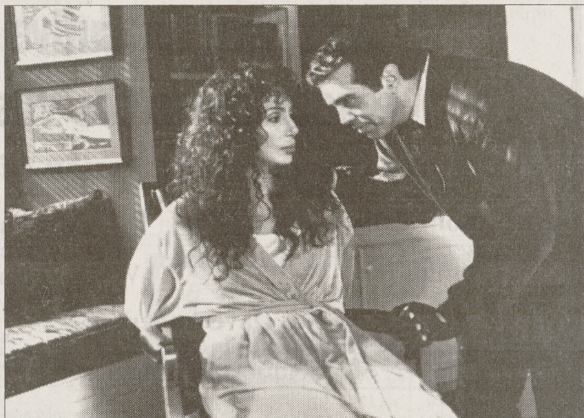
Chaz Palminteri plays Tony, a hitman hired to kill Margaret (Cher), in Faithful .

MOVIE REVIEW Faithful Starring Cher, Ryan O'Neal and Chaz Palminteri Directed by Paul Mazursky Rated R Playing at Hollywood 16 ★★★★ (out of five)