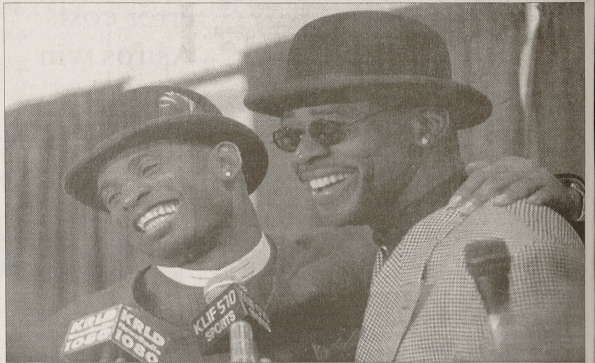
Dallas Cowboy stars Deion Sanders and Michael Irvin celebrate after defeating the Green Bay Packers in the NFC Championship Game this January. Irvin testified in front of a grand jury Tuesday.

Three other people who were in the motel room with Irvin also testified.