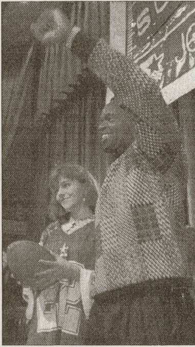
Emmitt Smith visits a Fort Worth middle school last Tuesday.

Smith is three touchdowns short of tying John Riggins' single-season touchdown mark of 24. Smith has 1,403 yards rushing, 171 ahead of Barry Sanders in the battle for the NFL rushing title.