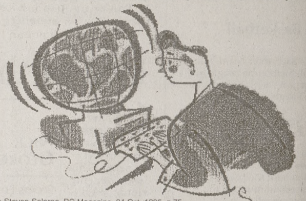
Illustration: Steven Salerno, PC Magazine, 24 Oct. 1995, p.75

Distance Learning at Texas A&M 1:30 p.m. MSC 201