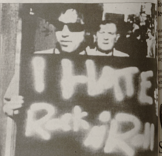
The Jesus and Mary Chain

Speaking of diversity, there's "Teenage Lust — Desdemona Mix," a dance song that has the feel of a remixed R&B song with a hard-core edge. This band actually pulls such an unusual mix off in classic form.