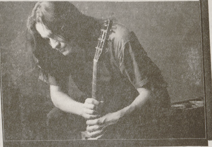
Stretch Records/Blue Thumb Records