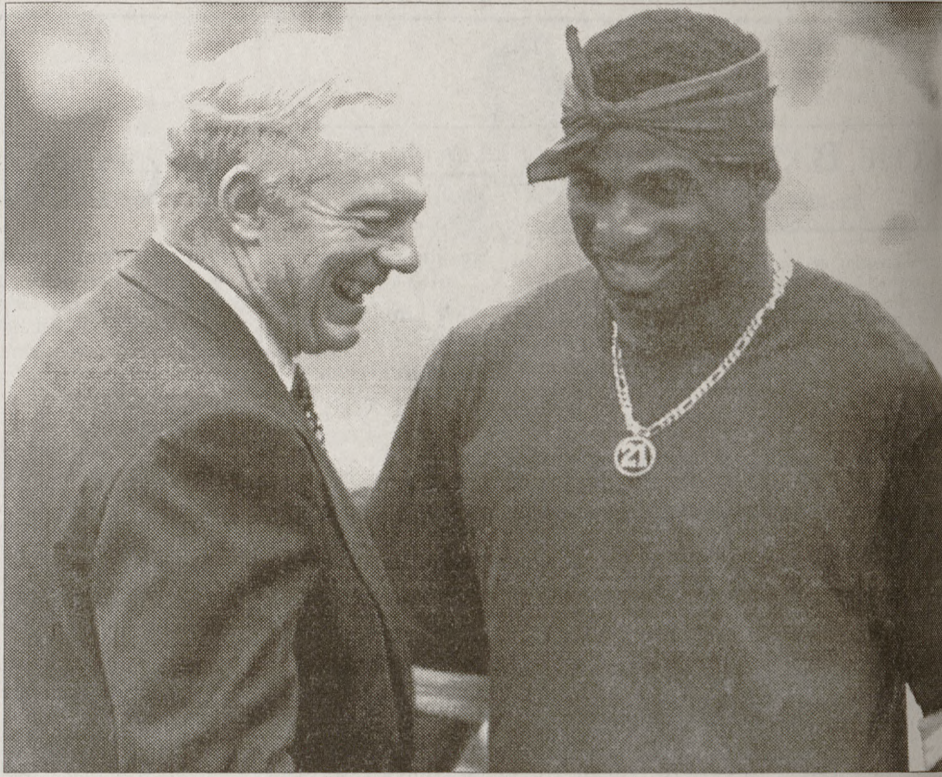
Dallas Cowboys' owner Jerry Jones and new employee Deion Sanders laugh it up on the sideline before the Cowboys' 27-23 loss to the Washington Redskins last Sunday.

American Express Travel Related Services Co. Inc. said it will become the official credit card of Texas Stadium, home of the Dallas Cowboys. Jones owns both.