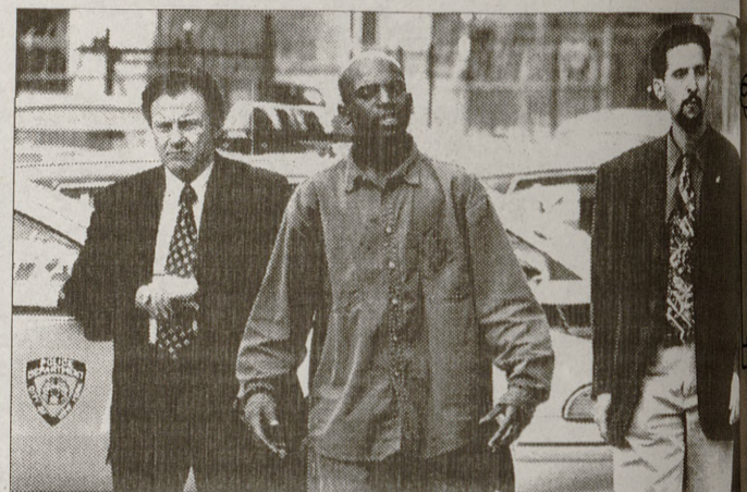
Harvey Keitel, Mekhi Phifer and John Turturro star in Clockers .

It seems that whenever Hollywood gets into a groove, Spike Lee comes around and throws a wrench into the works.