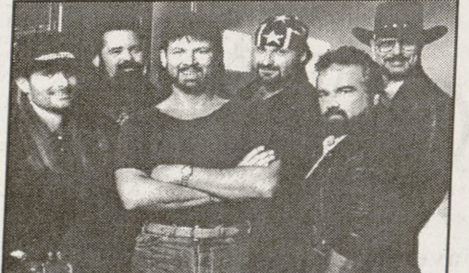
Confederate Railroad SEPT. 15TH