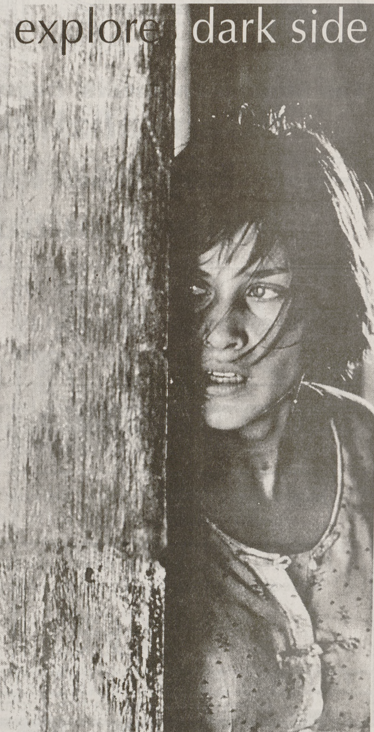
Patricia Arquette plays a tourist in Burma who gets caught up in the country's struggle for democracy.

save a film with a story that just does not work.