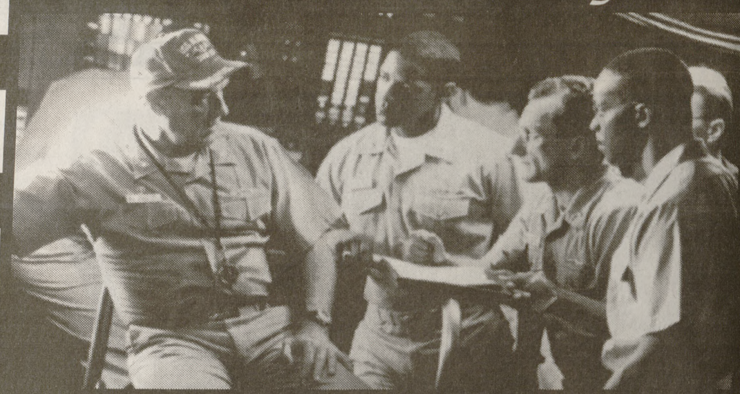
Denzel Washington and Gene Hackman star in the action film, Crimson Tide .