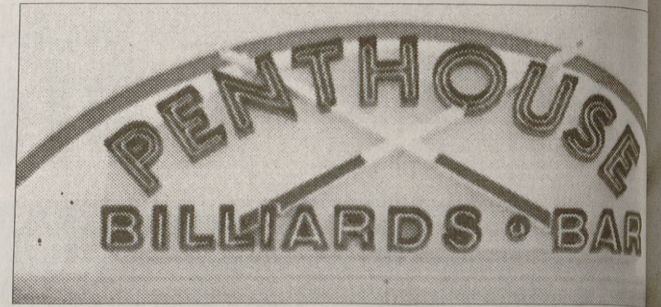
Stew Milne, THE BATTALION

If pool is not what patrons are after, however, there are other activities that can be en-