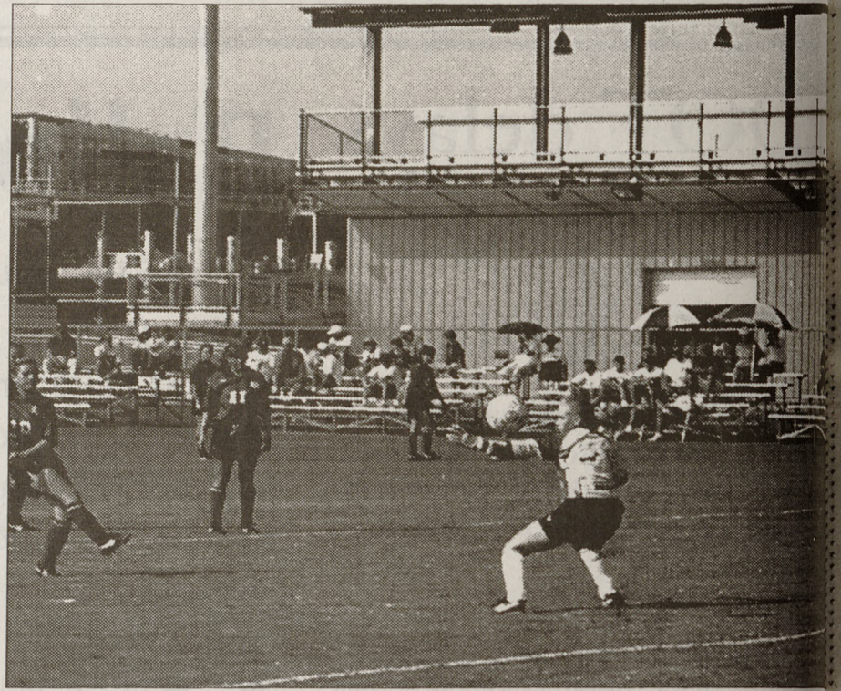
Members of the 1994 Texas A&M Soccer Team play against St. Edwards on Sept. 2, the first-ever game at the Aggie Soccer Complex.

Besides being a graveyard for opponents' winning streaks, the Aggie Soccer Complex is one of the finest of its kind in the nation and is still not completely built.