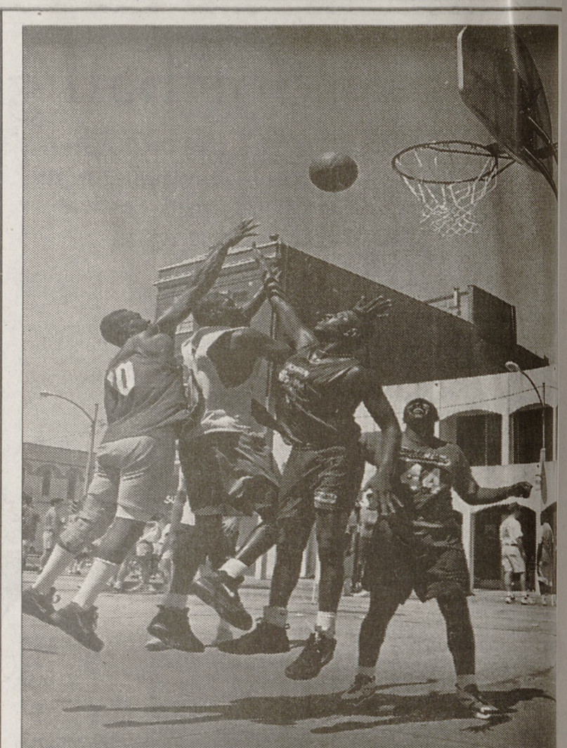
HOOPIN' IT UP FOR CHARITY Four players scramble for a loose ball at Saturday's Brazos Valley HOOP-N-WHOOP basketball tournament in Bryan.