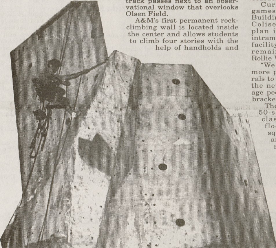
A 42-foot tall rock climbing wall is part of the new Student Recreational Center.

Information on all of the jobs can be obtained by calling the Rec Sports Department at 845-7826.