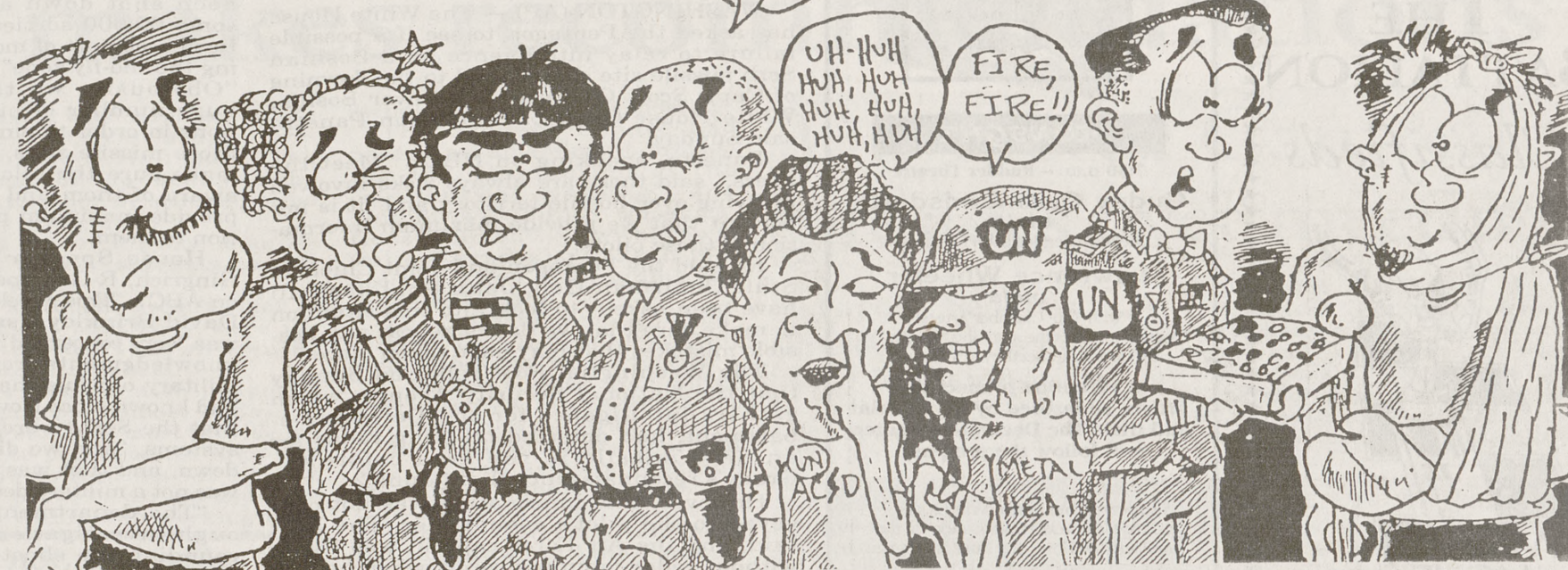
AT THE ARRIVAL OF UN. PEACE KEEPERS TO BOSNIA...