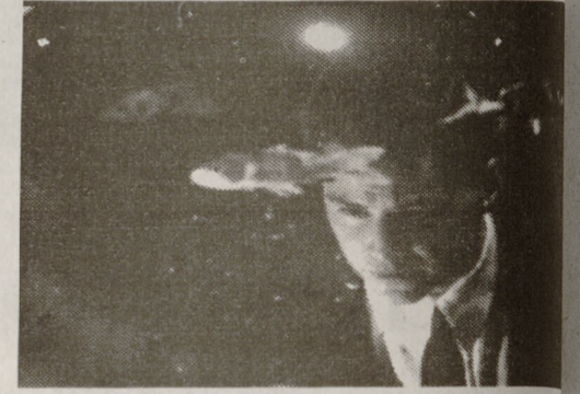
Reeves has information stored in his head that he uses to save the world as the title character in Johnny Mnemonic .

Karate master and action film star Dolph Lundgren delivers a testosterone-laden performance as Street Preacher, an information junkie who lives