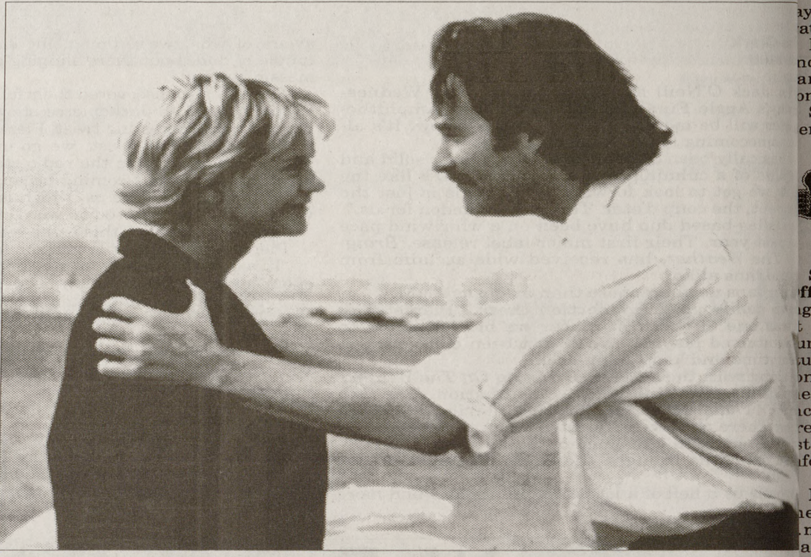
Meg Ryan and Kevin Kline star as characters chasing impossible dreams in French Kiss .

The problem with this chase scene is that there does not appear to be any ur-