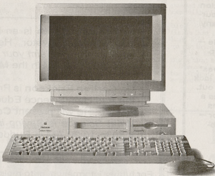
Macintosh Performer® 6115 w/CD

8 MB RAM/350 MB hard drive, CD-ROM drive, 15" color display, keyboard, mouse and all the software you're likely to need.