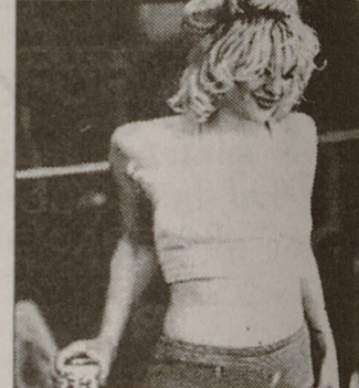
Courtney Love of Hole