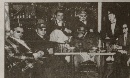
The Mighty Mighty Bosstones