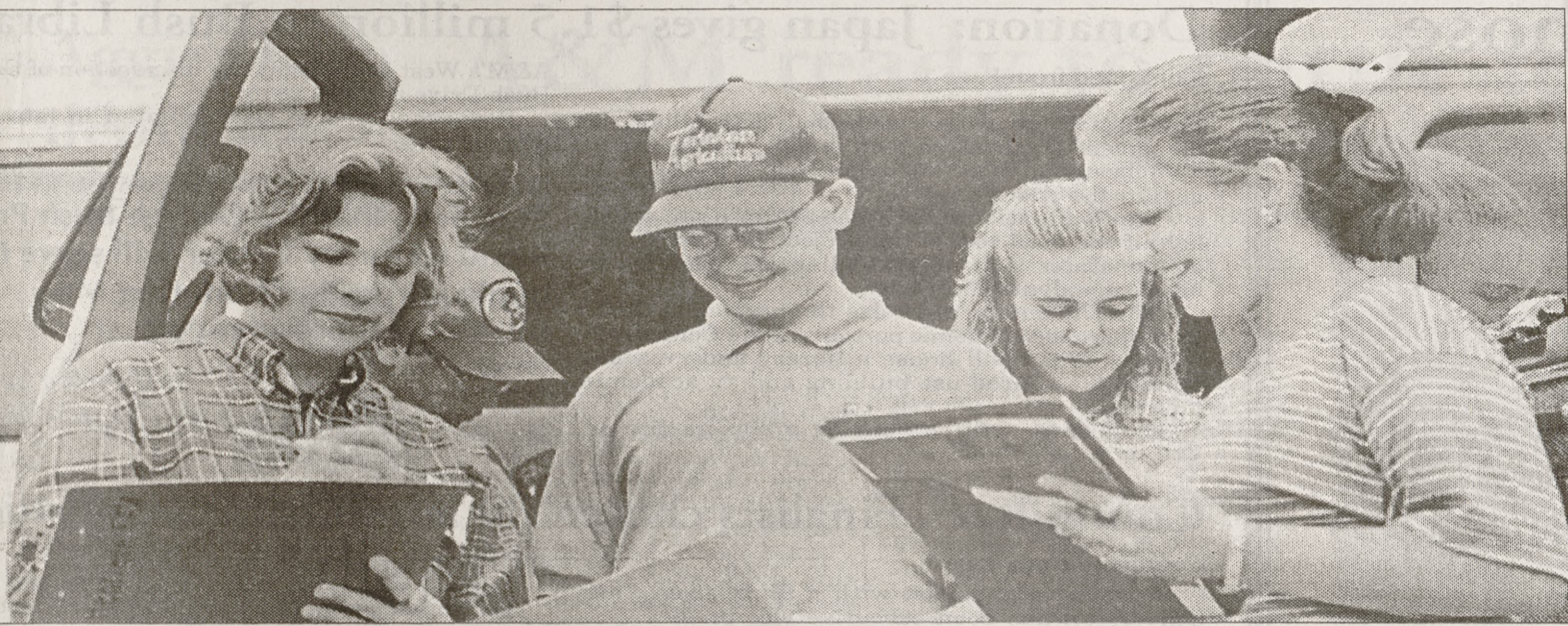
Misti Morris/SPECIAL TO THE BATTALION