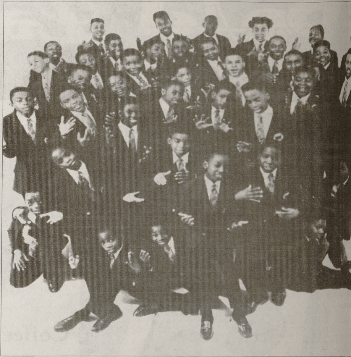
The Boy's Choir of Harlem