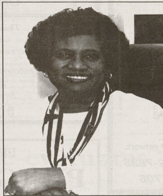
Dr. Joycelyn Elders Former U.S. Surgeon General 1993-94