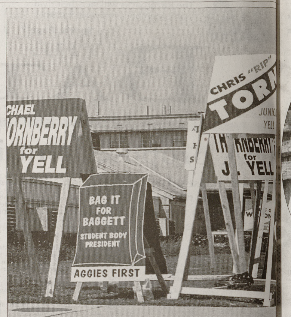
Vote for me! Sandwich boards for student body elections line Spence street letting students know who the candidates are. Elections will take place next week.