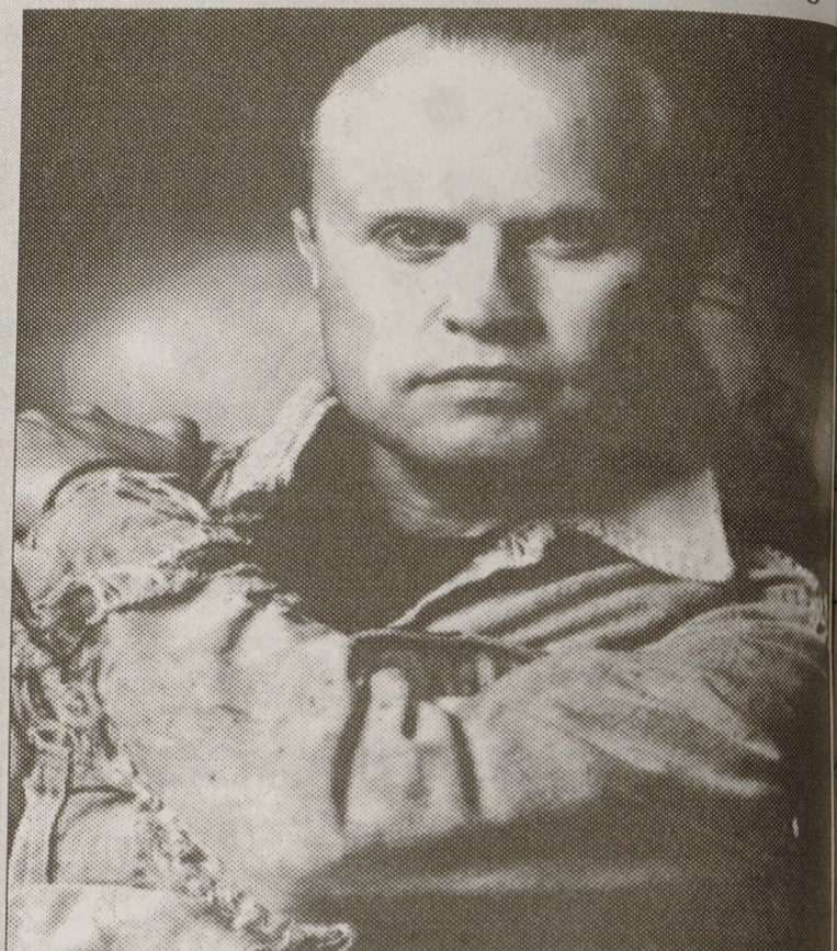
Mike Score, is lead singer and founder of A Flock of Seagulls performing tonight at 3rd Floor Cantina. A Flock of Seagulls is best known for the early-'80s hit "I Ran." The group won a Grammy award for Best Rock Instrumental Performance for the song "D.N.A."