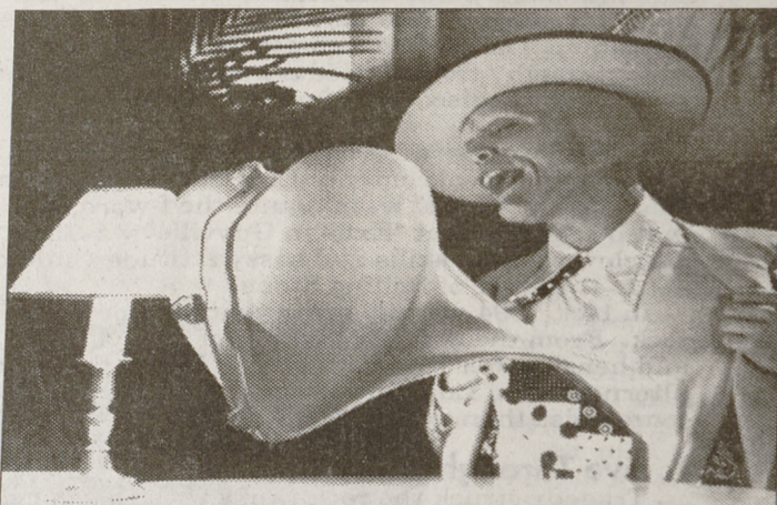
Jim Carrey hit it big in 1994 with three movies: "The Mask" (above), "Ace Ventura: Pet Detective" (below) and "Dumb and Dumber" (right).

Audiences really can't be blamed with the choices they were given. "Airheads," "Cabin Boy," "Clean Slate" and "The Scout" were not exactly "smokin'!"