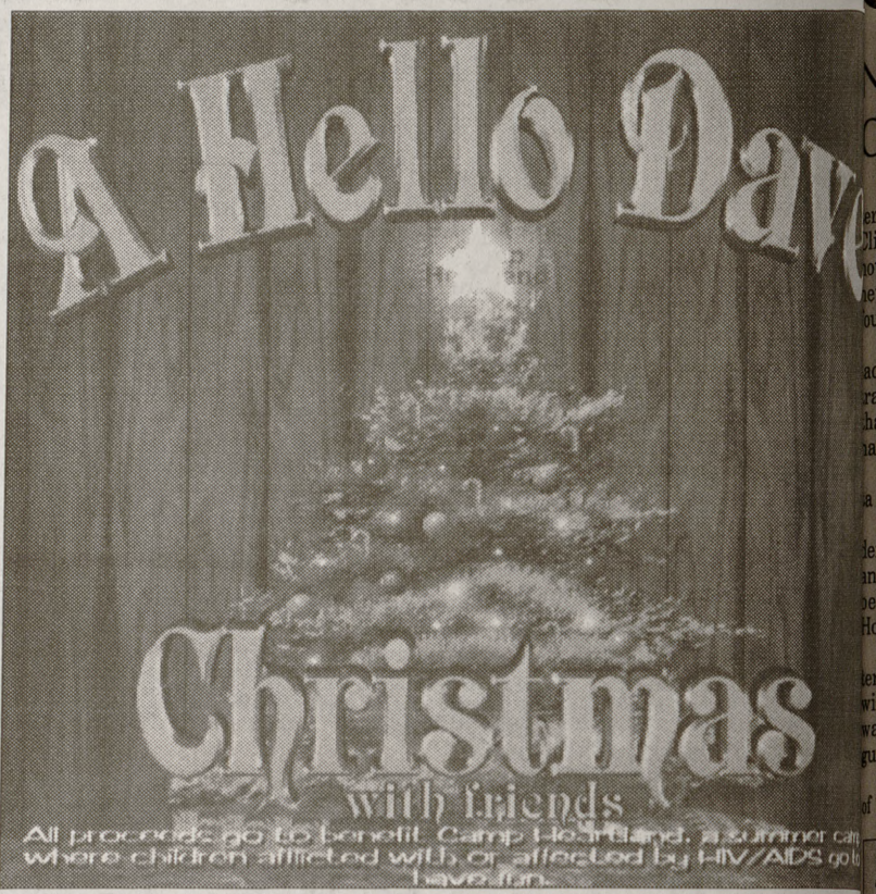
Chicago band Hello Dave's Christmas album benefits a summer camp devoted to the needs of children whose lives have been affected by AIDS.

Each song seems to be pushing toward the western edge of music but often encompasses blues rock. It is interesting, almost humorous, but leaves your wondering what they had in mind.