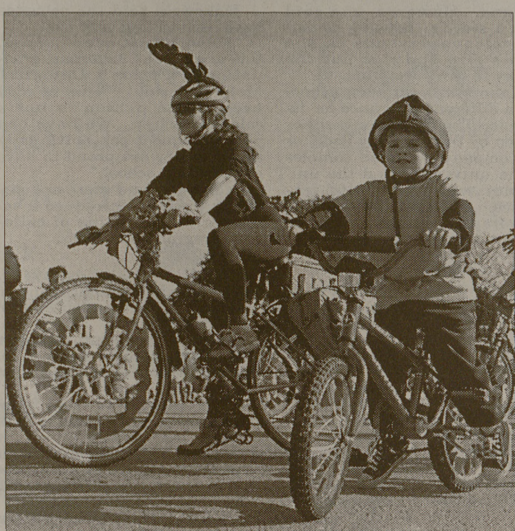
Stew Milne/The Battalion