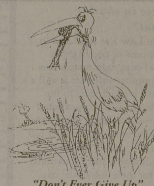
"Don't Ever Give Up"

Walk-Ins Welcome 215 University Dr. (Next to Campus Theatre)