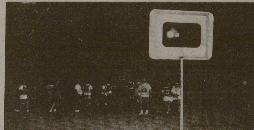
Flickerball entries open next Monday.