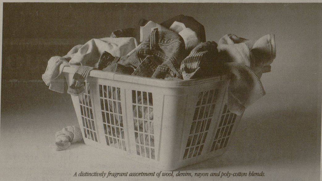
A distinctively fragrant assortment of wool, denim, rayon and poly-cotton blends.

Now you can really clean up when you buy a select Macintosh® Performa®. For a limited time, it comes bundled with a unique new student software set available only from Apple. It's all the software you're likely to need in college. You'll get software that takes you through every aspect of writing papers, the only personal organizer/calendar created for your student lifestyle and the Internet Companion to help you tap into on-line