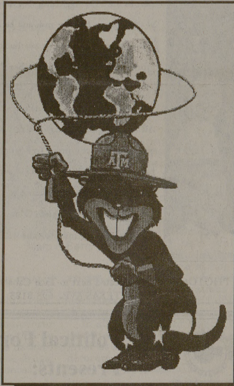
Our own Texas A&M Gopher

These examples are a tiny sampling of the information Gopher can deliver. The fantastic thing about Gopher is that you don't need to be a computer geek to use it. Gopher is easy to access and easy to use. If you have a VM, Open VMS/VAX or UNIX account, after logging on type Gopher to access Gopher's Root Menu. If you're a student, and you don't have an account, use ACCESS to create one. (Call 845-4217 for information.)