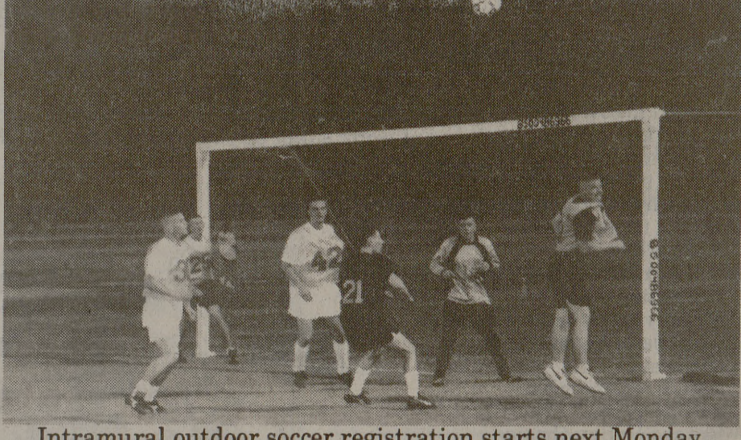
Intramural outdoor soccer registration starts next Monday.