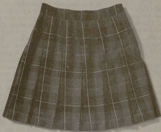
TARTAN SKIRT 17 99