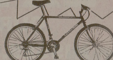
SCHWINN MOAB Mountain Bike

reg. $399.95 SALE PRICE $349.95 SMARTcash™ price $251.96 SAVE $147.99