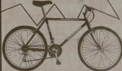
SCHWINN High Plains Mountain Bike

reg. $369.95 SALE PRICE $299.95 SMARTcash™ price $215.96 SAVE $153.99