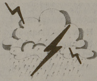
TAMU Chapter of the American Meteorological Society

Wednesday Partly cloudy with widely scattered afternoon showers and thunderstorms. High near 90.