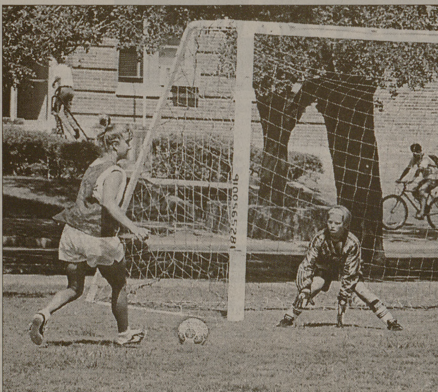
Stew Milne/The BATTALION