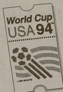
Monday's Games Brazil 1, U.S. 0 Netherlands 2, Ireland 0