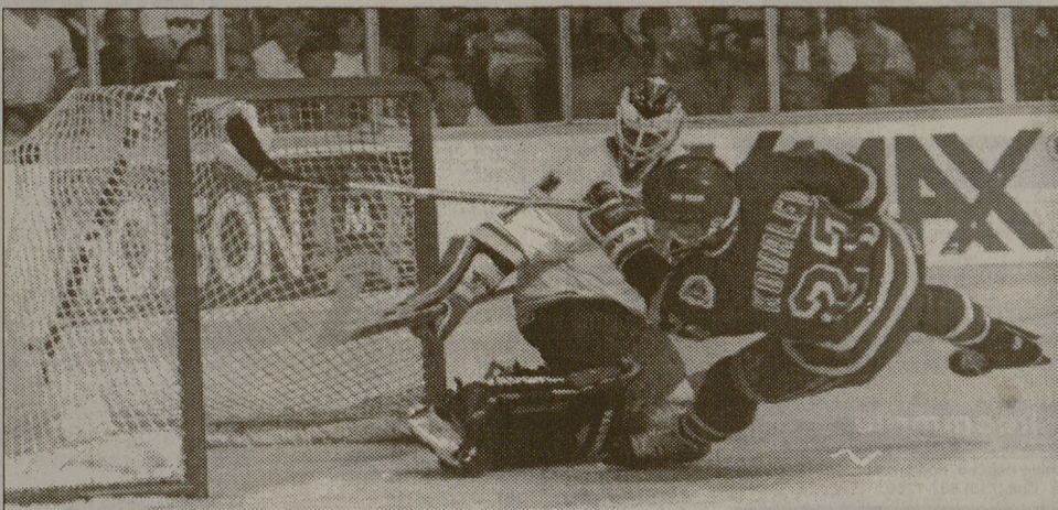
New York Rangers Alex Kovalev (27) scores on one foot against Vancouver Canucks goaltender Kirk McLean during game 3 of the Stanley Cup Playoffs.

The announcement that Rangers defenseman Brian Leetch won the Conn Smythe Trophy as playoff MVP