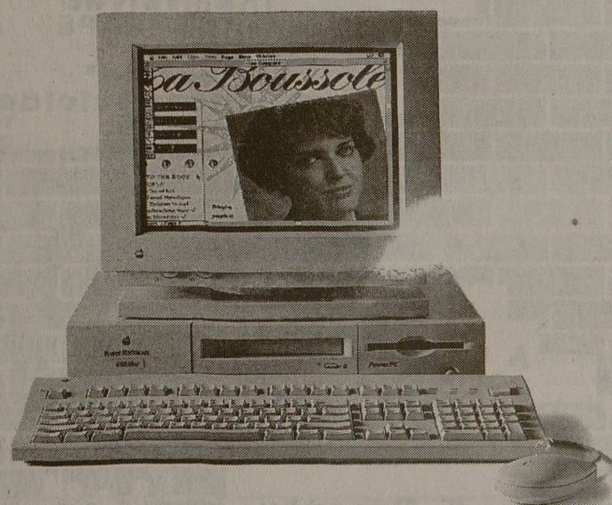
Power Macintosh™ 6100/60 8/250, internal AppleCD™ 300i Plus CD-ROM Drive, Macintosh® Color Display, Apple® Extended Keyboard II and mouse.