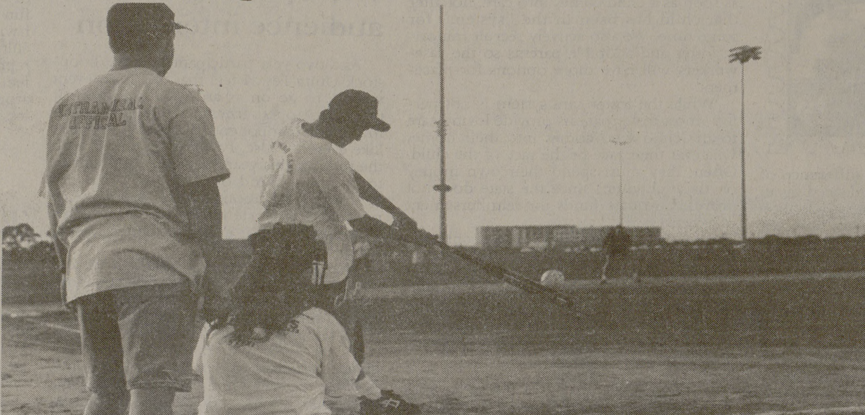
Entries for the Penberthy Softball Tournament close tomorrow.

Thanks to the sponsors of this tournament: CC Creations, McDonalds, and Dudley Softball Company!