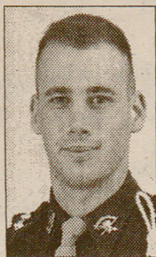
Ballot No. 5