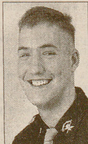
Ballot No. 4