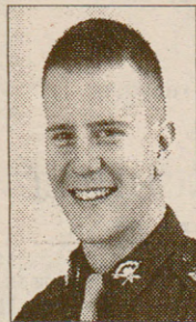
Ballot No. 3