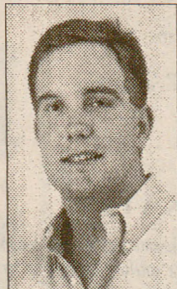
Ballot No. 5