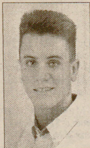
Ballot No. 2