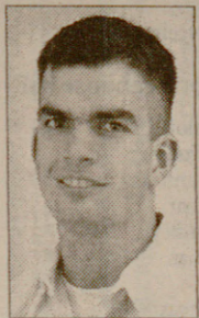
Ballot No. 3