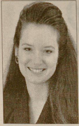
Major: Ag development

Howdy! I once heard the quote, "By confronting reality, we can change it . . ." The arrival of a new university president, upcoming state legislation proposing substantial funding cuts, an increase in our health center fee, the controversies surrounding the Board of Regents and athletic department and decreased campus safety are just a few of the realities that the new student body president will face. Through my experience as speaker pro tempore of the Student Senate, judicial board chair, Fish Camp counselor and motivational speaker for the national FFA, I have developed a unique ability to build coalitions and develop creative solutions that will effectively improve student life at Texas A&M. Securing additional reading days before finals, instituting a student book swap network, improving the University's image in the media and world community and tackling the previously mentioned issues will be difficult. Accomplishing these goals, however, will make a difference for all students at Texas A&M University. This is why I want the honor of serving as your student body president. I sincerely want to give back to the University that has made such a difference in my life. We face a tremendous task; but with faith, dedication and hard work there is nothing we as Aggies can't overcome. Let me make a difference as your student body president and together we can move mountains and change reality. Gig 'Em!