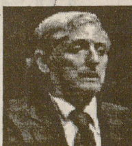
Mr. William F. Buckley, Jr. Moderator

Adults $12, $15, & $18 Students $9, $12, & $15