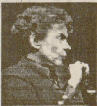
Dr. Jeane Kirkpatrick Former U.S. Ambassador to the U.N.