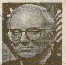
Mr. Les Aspin Former U.S. Secretary of Defense