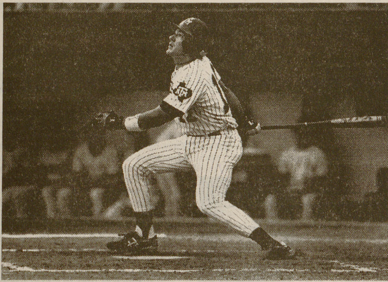
Battalion file photo

"If I get hurt some other outfielder is thinking 'great-I get his spot.' It's all a competition for the big