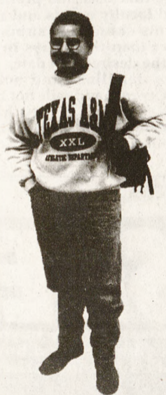
Texas A&M '89 Petroleum Engineering