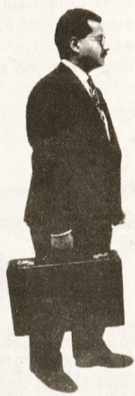
Texaco '94 Operations Engineer, New Orleans