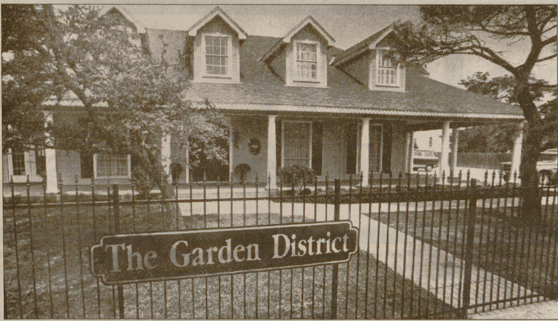
The Garden District, located a few blocks from campus, was founded in 1983 and is quickly becoming one of the area's hottest tourist attractions.