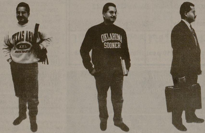
Texas A&M '89 Petroleum Engineering

Application forms should be picked up and returned to the Student Publications Manager's office, room 230 Reed McDonald Bldg. Deadline for submitting application: 5 p.m. Monday, March 21. Applicants will be interviewed during the Student Publications Board Meeting beginning at 5 p.m. Wednesday, March 23, 1994.